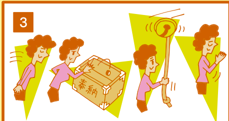
When you approach the shrine, bow slightly, ring the bell and make a small offering.