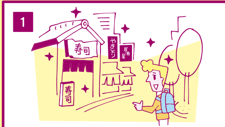
Fukuoka has many great places to eat and drink.