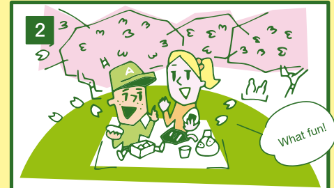
Each season brings new scenery for your enjoyment.