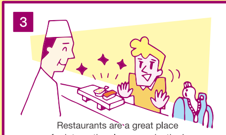
Restaurants are a great place for international communication!