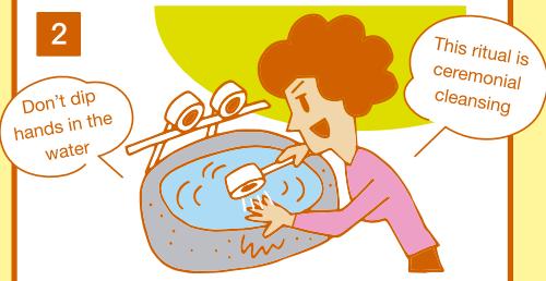
Wash your hands before approaching the shrine.