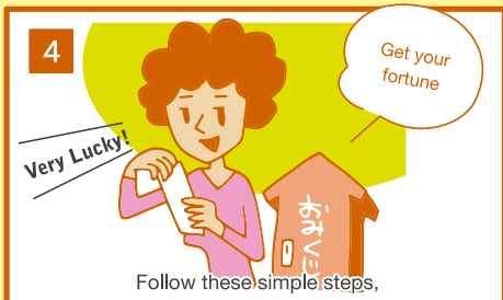
Follow these simple steps, and you may be rewarded with good fortune.