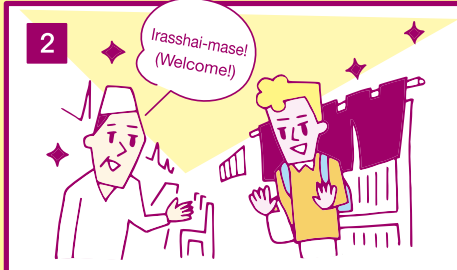
You will be sure to come across a shop you love.