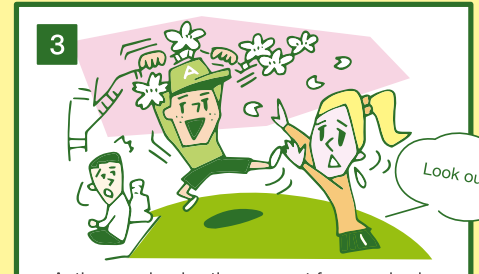
Acting rough ruins the moment for everybody.