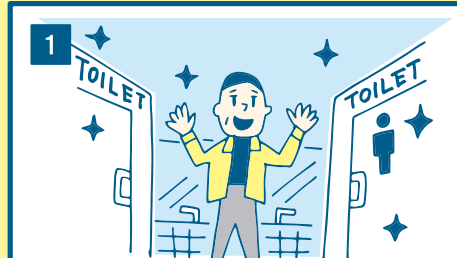
Japan prides itself on its clean toilets.