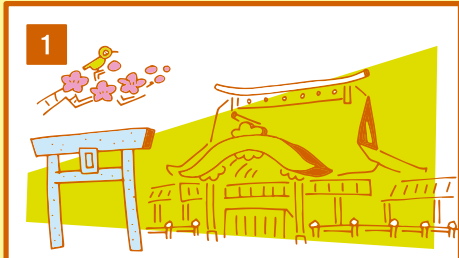
Fukuoka has many historically-important Shinto shrines.